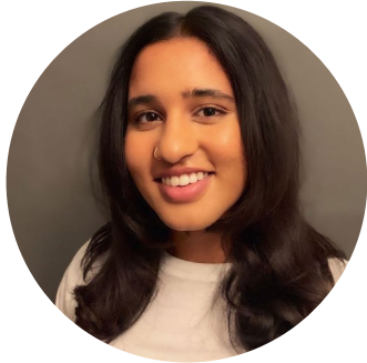
Chief Operating Officer, Chargehound