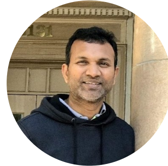
Senior Director of Engineering, Patreon